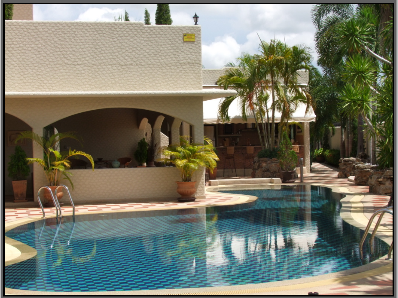
20 Metre private swimming pool