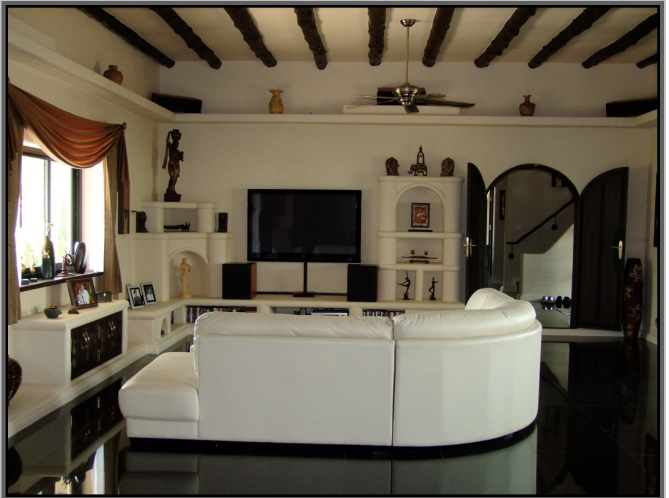
Custom fitted furniture with solid wood fittings (Lounge 1)