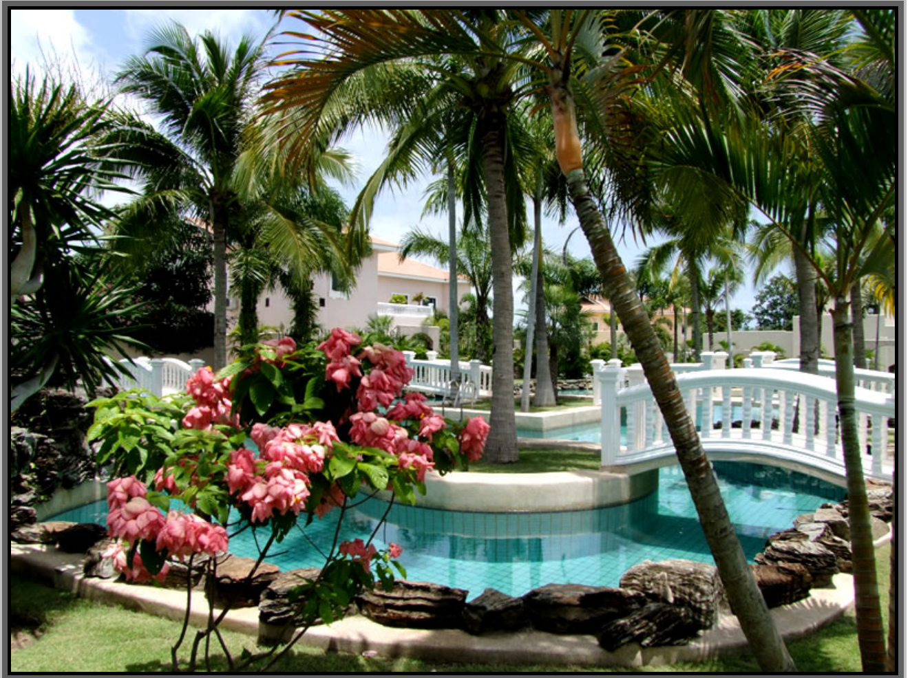
30m x 15 m communal pool in beautiful landscaped surroundings