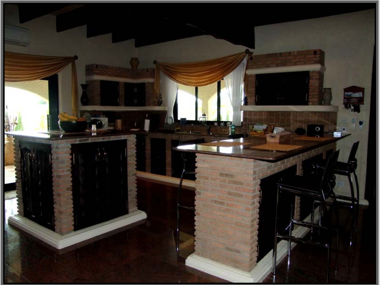
Custom Fitted Kitchen