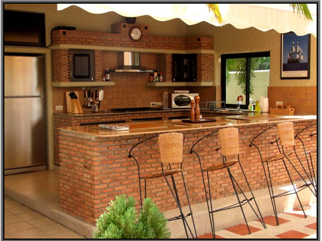
External Kitchen / Bar