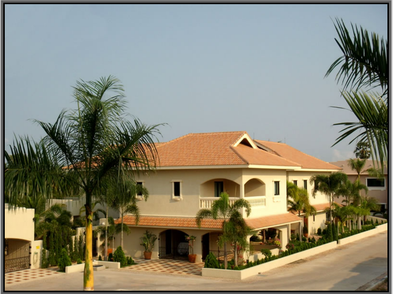
Well designed exterior with plenty of balcony area