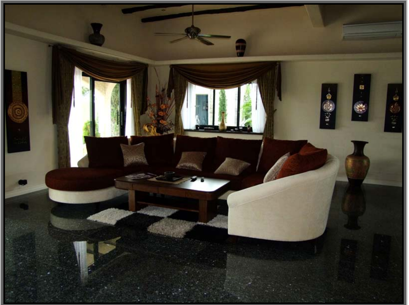
Beautiful & Spacious (Lounge 2)